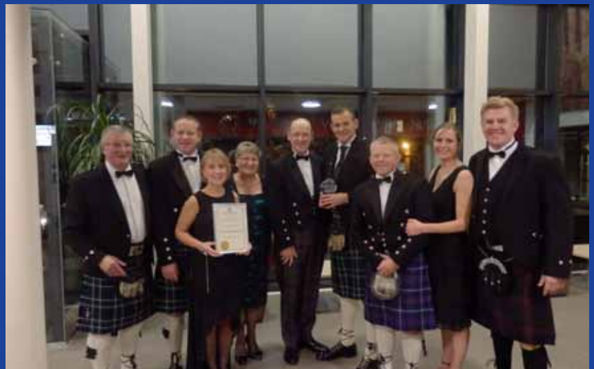
(pictured are the Directors and Senior Managers of GES receiving their award from John Swinney MSP)