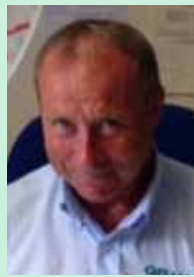
Vladimir Putin (President of Russia)